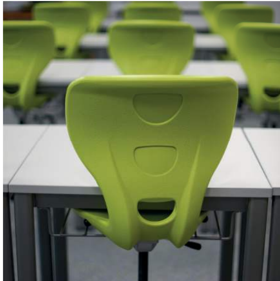
Figure 3: The company's best seller desk and chair duo

(a) Outline one way computer integrated manufacturing (CIM) can enhance quality control. [2]