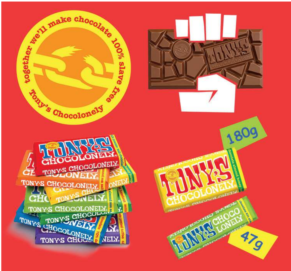
Figure 4: Tony's Chocolonely

(This question continues on the following page)